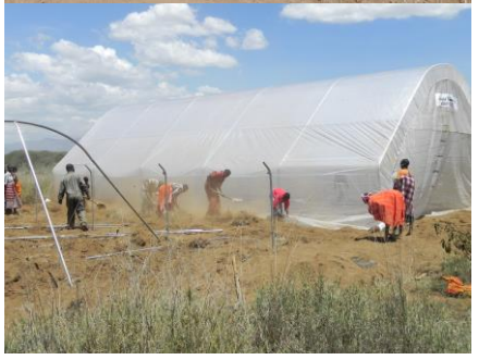
The local community helping in the erecting of the greenhouses.

As we prepare to enter Holy Week I take this opportunity to wish each and every one of you and your families a very happy celebration of Easter.