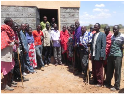
Najile Site being handed over to the local community by the Chairman of the Parish.

The work of building water tanks continues in Namuncha and Enkuserokeri and once these are complete we will move to Enkorika. Since last writing our work has finished in several areas and we have been able to hand over the sites at Ewuaso, Najile and Osero to the local community who will manage the water for their area.