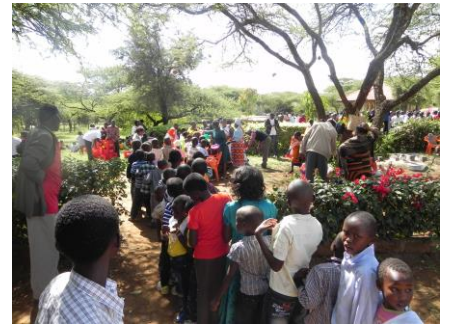
The queue for food... children first and then....