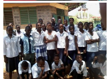
Some of those who received the sacrament