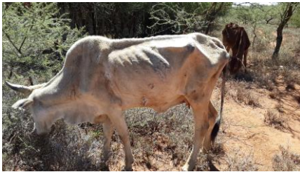
Cows just outside our fence the other day