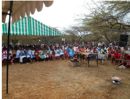
Mass under the African sun

The celebration was led by our Bishop and attended by priests from different parts of the Diocese and beyond, as well as many dignitaries and people from far and wide.