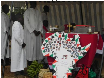
Gifts in front of the altar including a map of Africa with photos of the disabled children who have been helped by St. Rose of Lima parish in Patterson, New Jersey.

After the celebration of the Mass the Bishop blessed and opened the new buildings of our Girls Rescue Centre and the extension to the parish house.