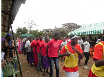
Children dance to accompany the offertory procession