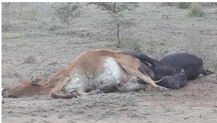
Carcasses I saw on my way to Empaash last week

As times passes the nomadic pastoral way of life of the Maasai becomes more difficult. With climate change, increased population and more and more people fencing their property it becomes more hazardous for the traditional way of life to continue. A few people in the area have begun to follow the example that we have shown by keeping a few dairy cattle and feeding them hay. We try to encourage them not only by our example but also by selling the calves we get from our cows at a very cheap price.