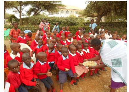
Some of the kindergarten children receive cake

Following that there was much entertainment and we all shared a wonderful meal prepared by the parishioners.